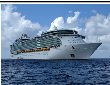
Royal Caribbean LIBERTY OF THE SEAS

Average Cost of a Stateroom For 2 People