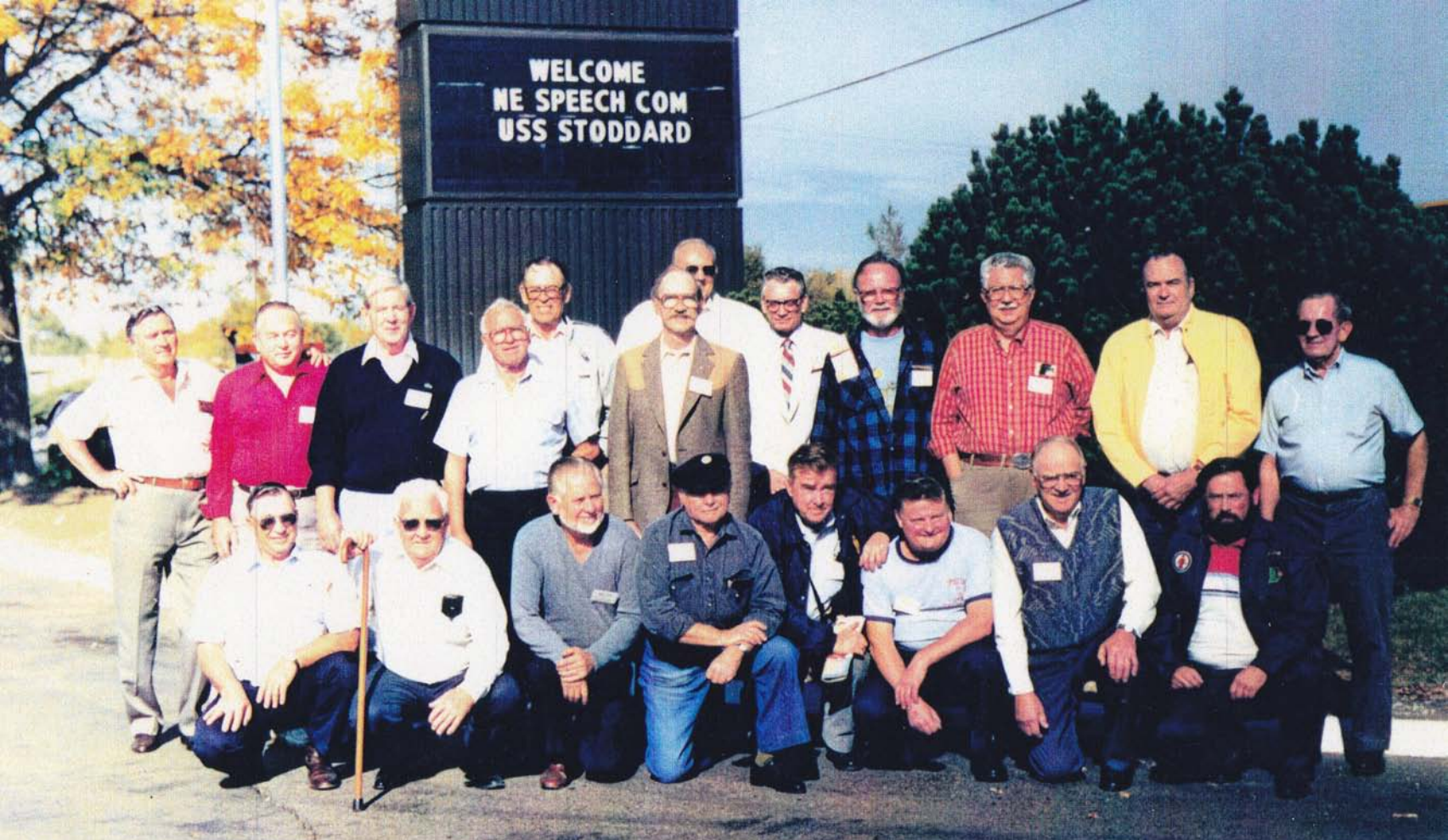
1st Reunion - North Platte, NE 1986