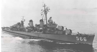
USS STODDARD DD566 ALUMNI WWII * Korea * Vietnam