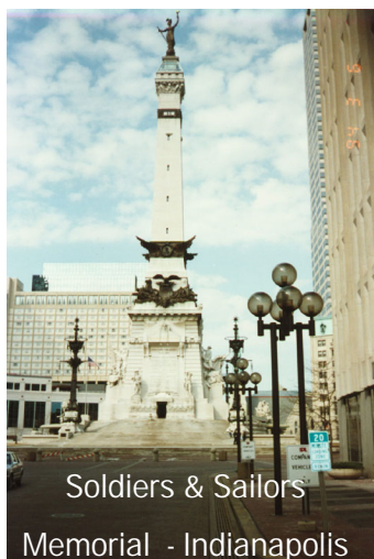
Soldiers & Sailors Memorial - Indianapolis

21st Reunion - Indianapolis—September 24th—26th, 2009