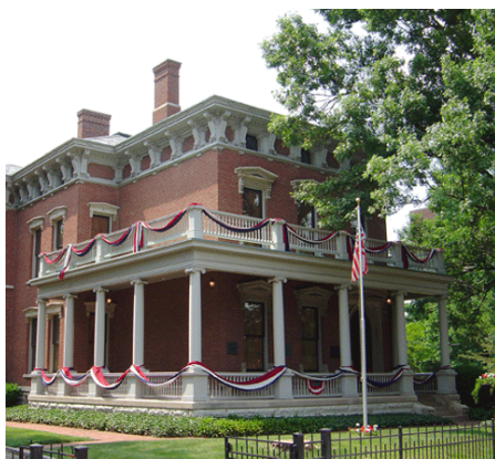
President Benjamin Harrison Home