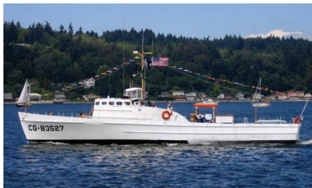
The restored and fully flag-dressed CG-83527 makes her way along Ruston Way in 2005, as part of the "Tacoma Tall Ships" event. As a participant in the more than 30-vessel "Parade of Sail," the 83-foot wooden cutter was making a nostalgic return appearance in her long-time homeport, which she served beginning in 1945 at the end of WWII.

I had kept my interest in fast power boats during my college and early career years. First, I owned a series of gradually larger, more powerful and faster race boats—beginning with an eight-foot homemade plywood outboard and ending with a 27-foot offshore racer.