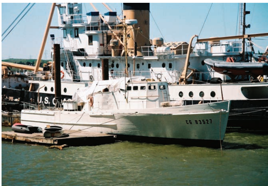
The tired, virtually abandoned CG-83527, is shown at the American Patrol Boats Museum dock in Rio Vista in April, 2004—when on-site restoration began. Behind the WWII-era patrol boat is the former Coast Guard buoy tender FIR, once based in Seattle; and the focus of an extensive civic restoration effort which unfortunately failed.

Another particularly significant highlight of CG-83527's recent history was the 2008 "Coast Guard Heritage Fleet" parade. This event featured the