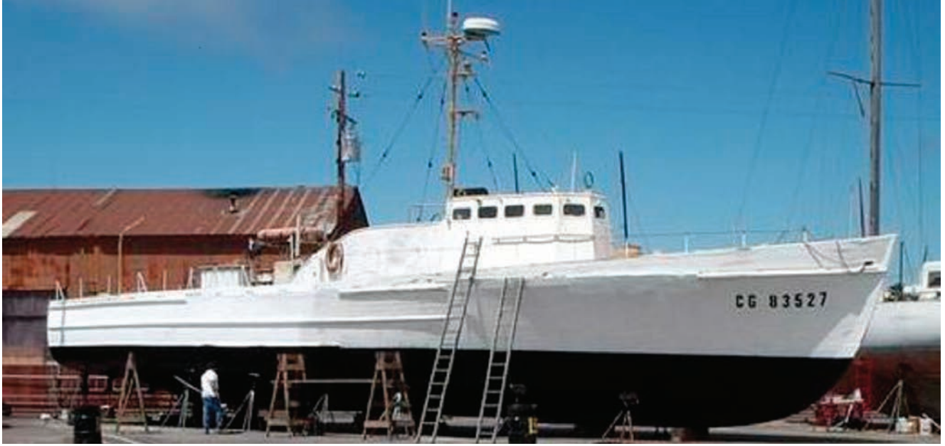
Prior to her 2004 return voyage to Puget Sound, the cutter CG-83527 was hauled out for inspection, hull repair, and painting at Bay Ship and Marine in Richmond, north of San Francisco. Preparations and sea trials were completed in June, and the trip up the coast began.