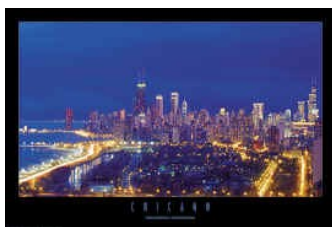
Chicago Sky Line

Saturday evening at 4:30PM—The annual Stoddard Business Meeting. The Annual Awards Banquet will be held in the hotel. The banquet will be a semi-formal served dinner, with one hour open bar. Banquet photos taken before dinner. Please let us know those you wish to sit with at the banquet. We will prepare a seating schedule.